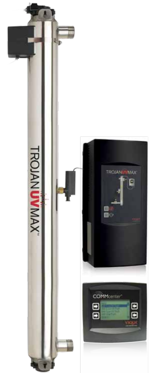
LIGHT COMMERCIAL APPLICATIONS